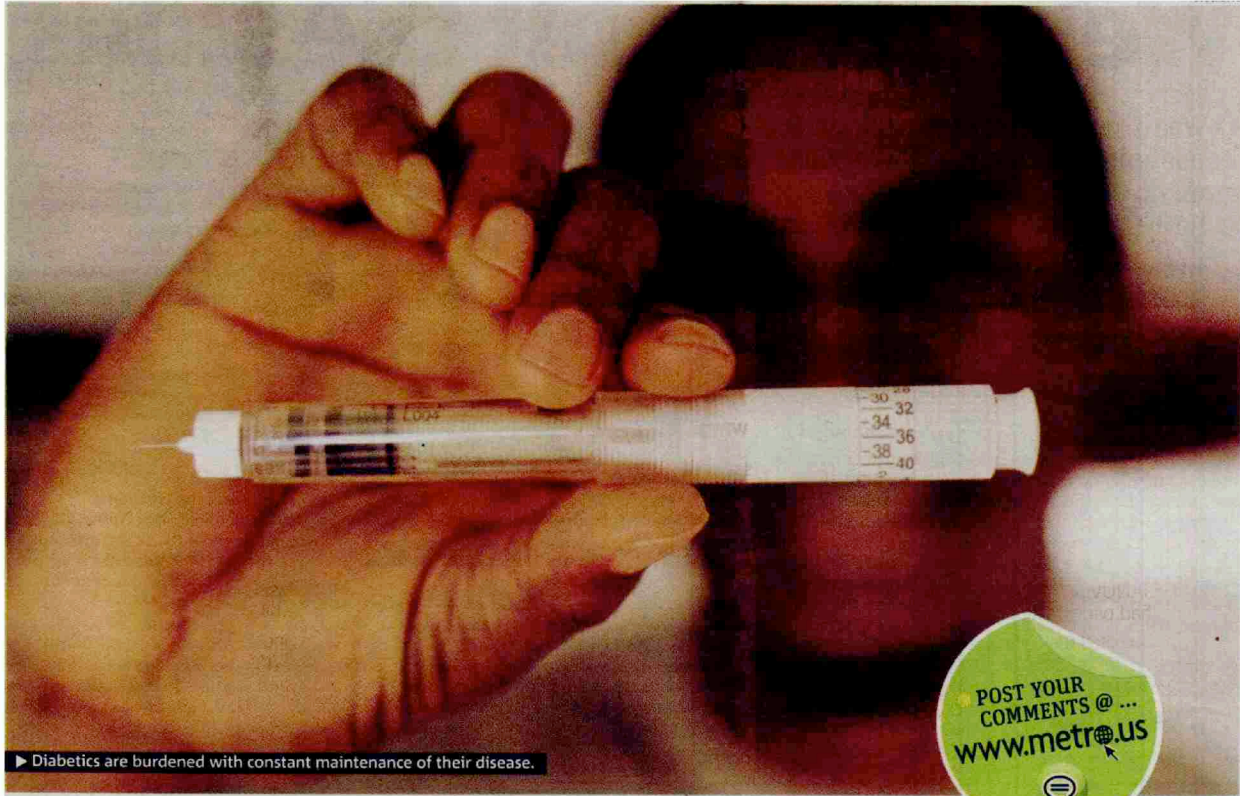
▶ Diabetics are burdened with constant maintenance of their disease.